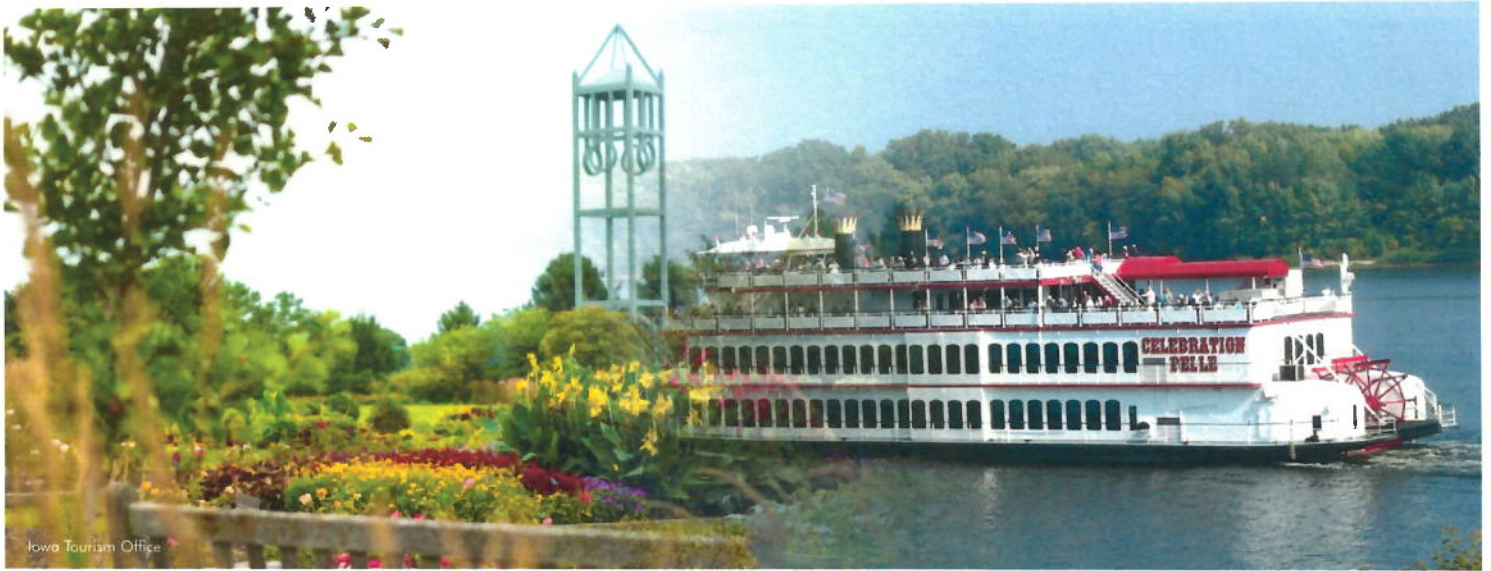
Iowa Tourism Office