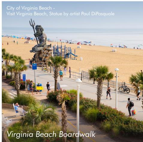
Virginia Beach Boardwalk