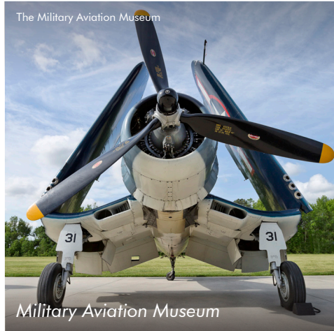
Military Aviation Museum