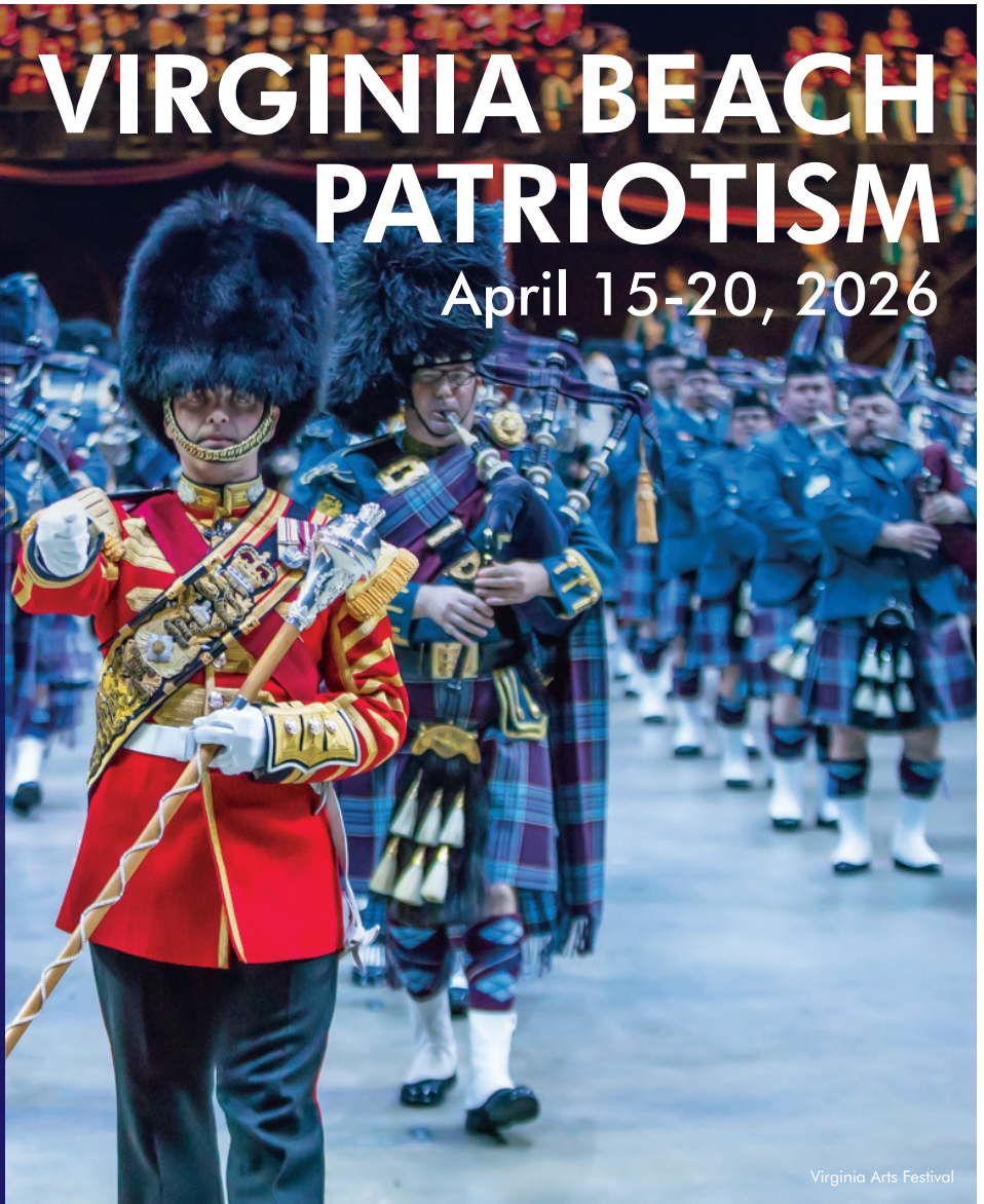
Virginia Arts Festival